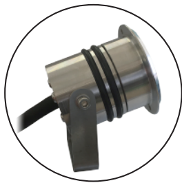
SWIVEL U BRACKET