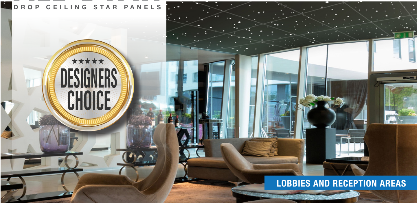
LOBBIES AND RECEPTION AREAS

THE MOST IMPRESSIVE 3-D STAR EFFECTS ON THE MARKET TODAY!